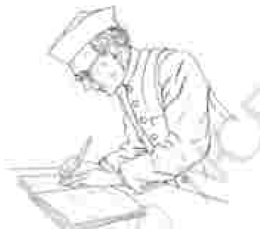
Jawaharlal Nehru CAG Vol. VI, p. 734

"We did not give him any real power but we have made his position one of authority and dignity. The constitution wants to create neither a real executive nor a mere figurehead, but a head that neither vetoes nor governs. It wants to create a great figurehead."